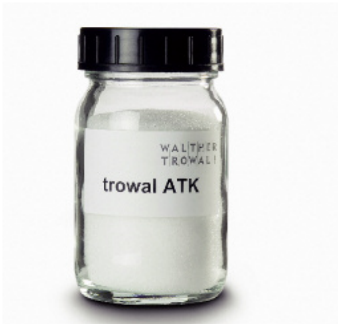
ATK anti-adhesion balls