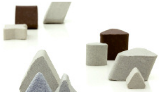
Selection of ceramic chips