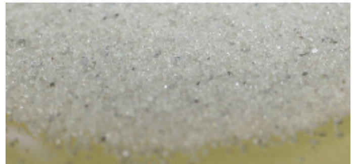
9A powder compound

To increase the grinding performance, the 9A powder compound can be added, too. Too smooth and blurred chips are roughened and cleaned.