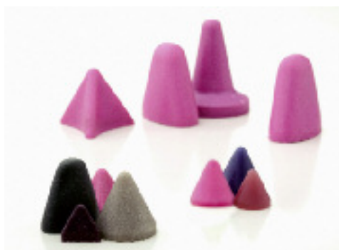
Selection of plastic chips