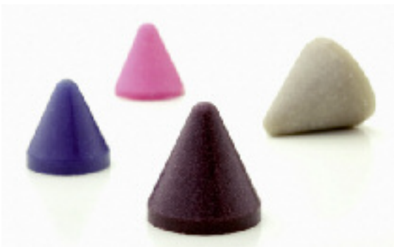
Cones of different size and abrasiveness

The shape of the chip must be selected in a way that all edges and contours of the work pieces can be reached without chips jamming therein.