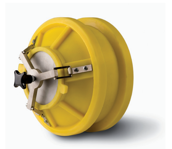
PU barrel with lid locking mechanism