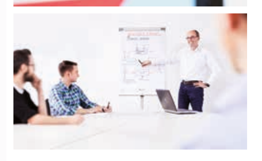
AT WALTHER TROWAL YOU ALWAYS DEAL WITH COMPETENT PROFESSIONALS!