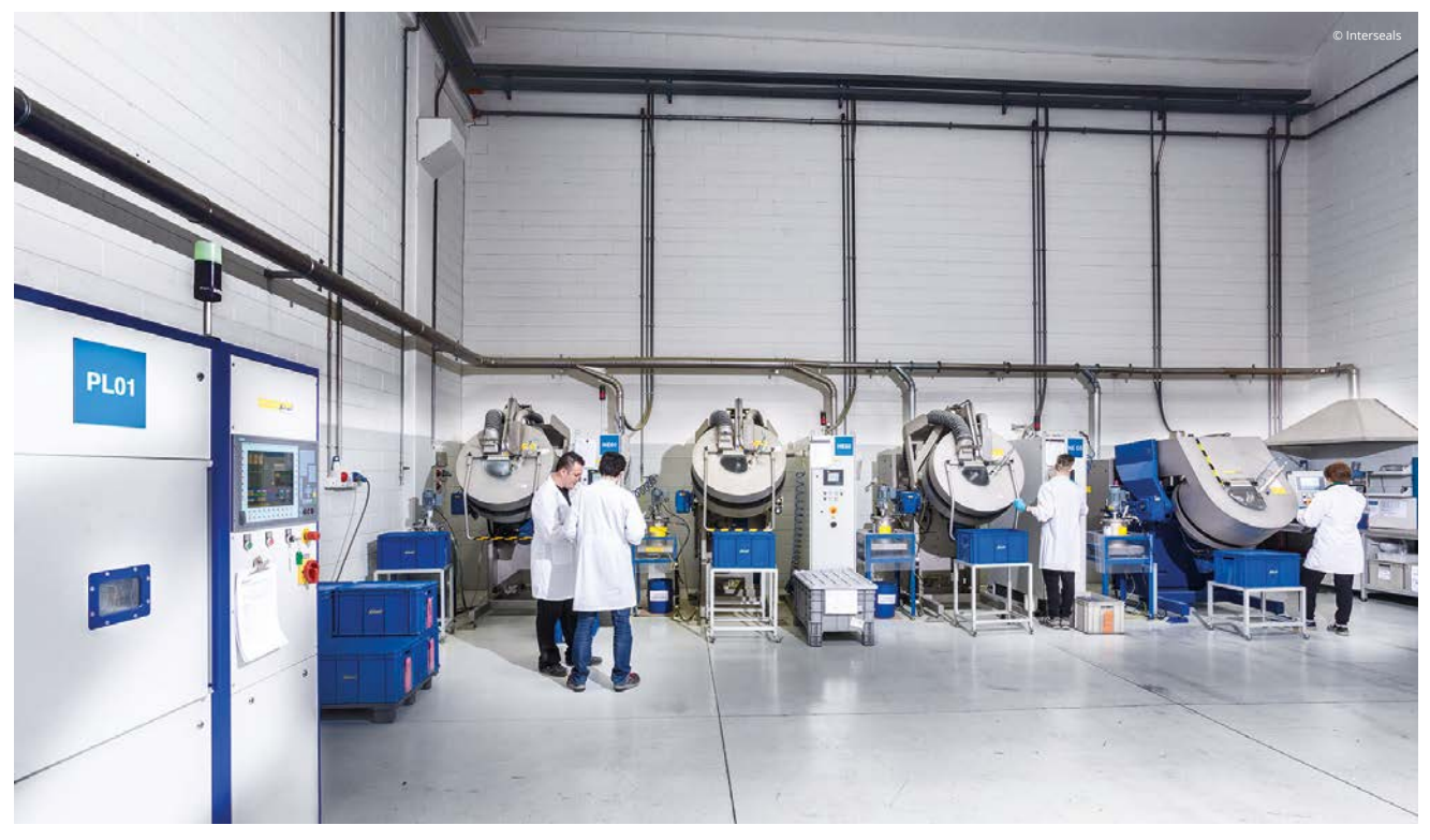
At its plant in Capriolo Interseals operates four Rotamat coaters. At Pol-Technology in Poland another three units are installed.