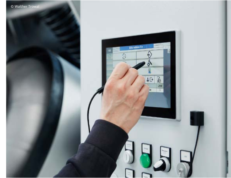
A detail of the touch screen.