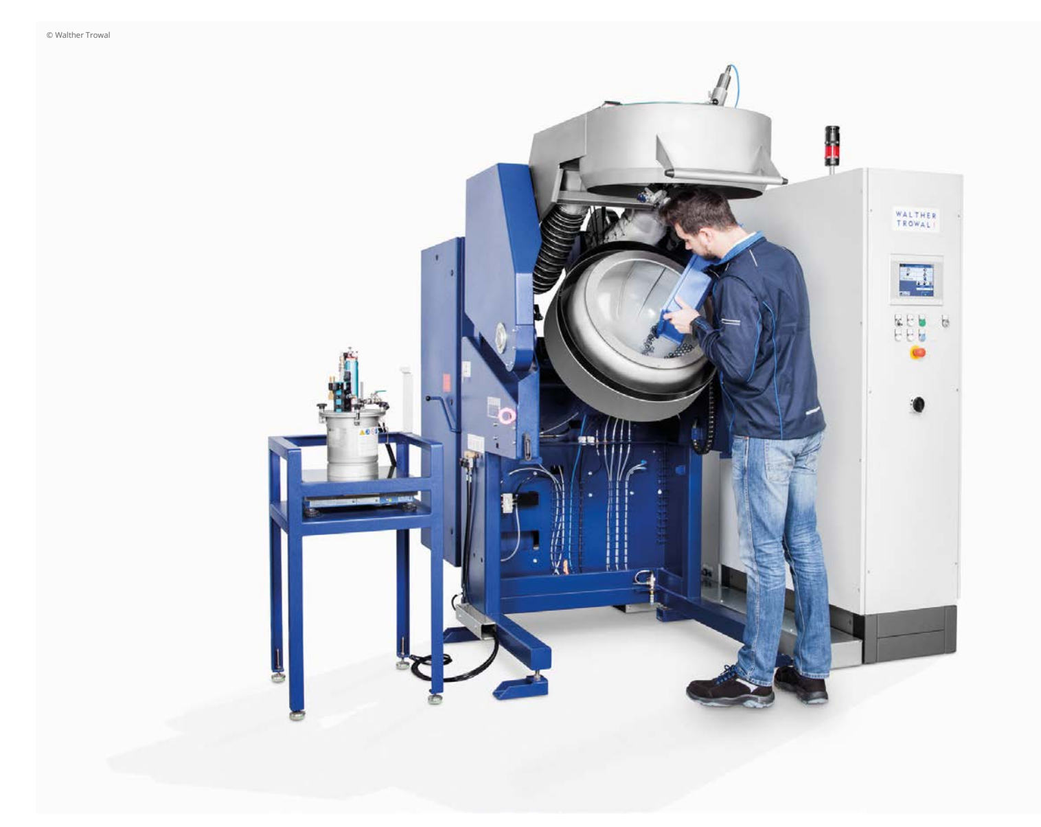
The new R 60 Rotamat system can also handle work piece volumes of under 15 l.

During the entire coating process pre-heated, turbulence-free air is guided into the rotating drum to heat the parts to the specified temperature. The work piece temperature is directly and continuously measured with an IR sensor. A PID controller sets the temperature depending on the work piece temperature. At the same time, it takes into account the actual air flow. Because of its high efficiency, the machines require a relatively low power input of a few kW's. Upon completion of the coating process the work pieces are unloaded by mechanically tilting the drum downwards. Post drying, for example, in a special oven, is no longer necessary. The parts are discharged from the drum completely dry and can be immediately processed in the next manufacturing stage.