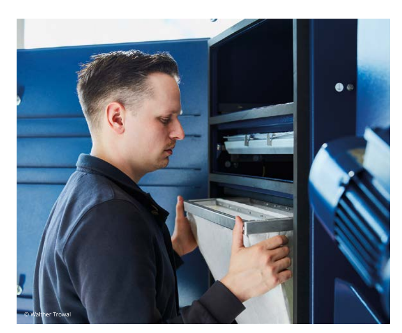
Filter cabinet can be equipped with disconnect options.

In addition to its own production and the analytical services in its internal lab C.S.I. is also studying new materials. One important research project deals with solid lubricants with anti-microbial or bacteria resistant characteristics.