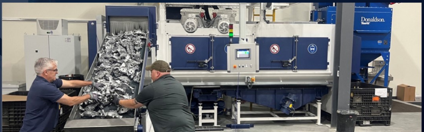
A THM 400 shot blast machine in the TTC test and training center in Grand Rapids/USA is loaded with aluminum die-castings for the automobile industry.

Walther Trowal at GIFA 2023: Düsseldorf/Germany, June 12 to 16, 2023 Halle 15 / Stand D15