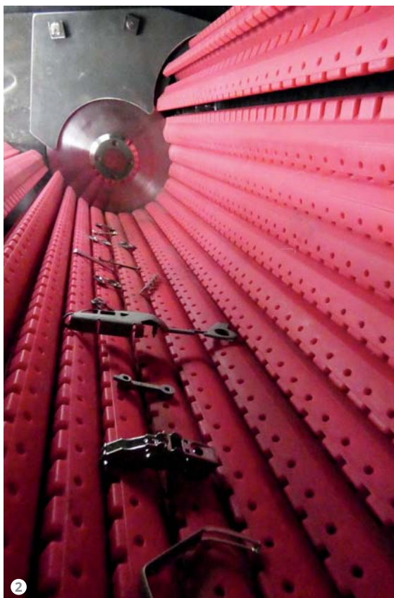
Figure 2: The troughed belt blast machine THM 300/1 is ideal for continuous feed blast cleaning of small work pieces. To demonstrate the work piece variety this machine can handle, for the photo different components were placed on the troughed belt.