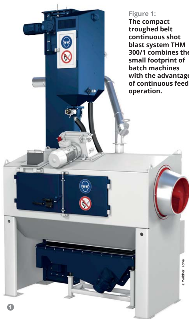
Figure 1: The compact troughed belt continuous shot blast system THM 300/1 combines the small footprint of batch machines with the advantages of continuous feed operation.

A communication processor allows integrating the shot blasting operation into higher-level process controls. Explosion protected dust collectors ensure safe operation in line with prevailing explosion prevention standards.