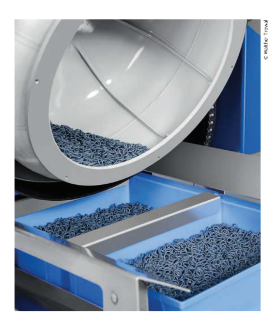
For unloading of the finished parts a pneumatic cylinder tilts the drum downwards.

For this reason, Walther Trowal has added a by-pass that, upon completion of the coating process, circumvents the heating unit and guides ambient air into the coating drum. This prevents the work pieces from sticking to each other, when they are discharged from the machine. The result: A higher ratio of finished work pieces in premium quality.