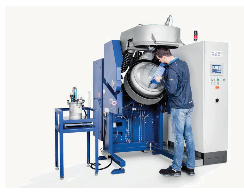
The tilting angle of the drum can be set at any value. The cover is opened mechanically.