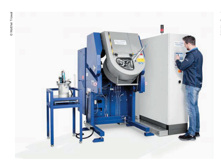
The new Rotamat units, including the exhaust air filter, can be operated from a touch panel.

Some paint systems or coatings demand a quick, sometimes abrupt, cooling phase of the work pieces after the coating operation.